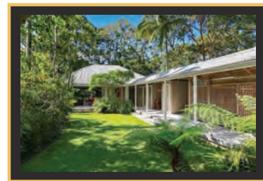
2 FAMILY GETAWAY PAVILLIONS PEARL BEACH