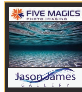
SERENE PHOTOGRAPHIC ARTWORK