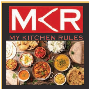
PRIVATE CHEF INDIAN FEAST