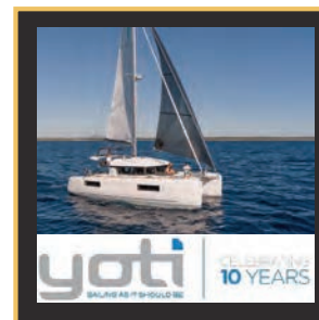
YOTI SKIPPED 5 HOUR SAIL