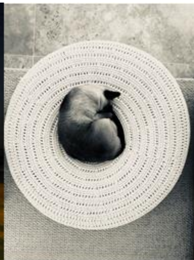
A Circle on a Circle Charlie M